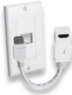
HDMI WALL PLATE HD.MC-RPM