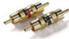
M TO M RCA ADAPTOR ZPR401

90 Degree Right Angle RCA Adapter Gun-Metal Finish with Gold Plated Contacts Short Body Design Sold as a Pair