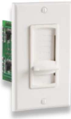
VOLUME CONTROL VSL125IM