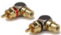
90 DEGREE RCA ADAPTOR ZPR416

Dual 90 Degree Right Angle RCA Adapter Gun-Metal Finish with Gold Plated Contacts 2 Female to 1 Male Sold Individually