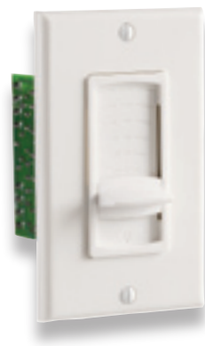
VOLUME CONTROL VSL125RB (RESISTOR BASED)