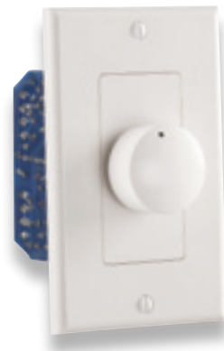
VOLUME CONTROL VRR 120W (RESISTOR BASED)