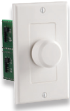
VOLUME CONTROL VMT 100W